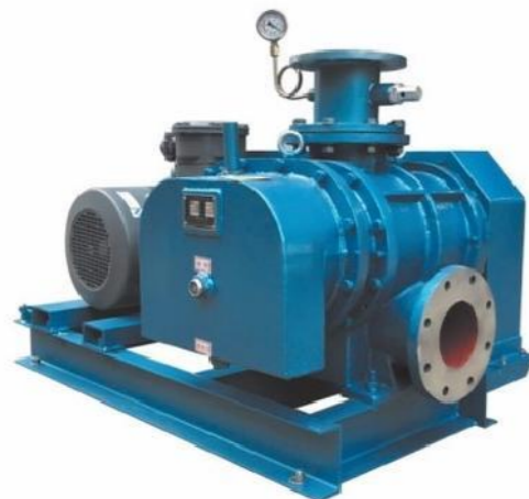
Negative pressure Roots blower