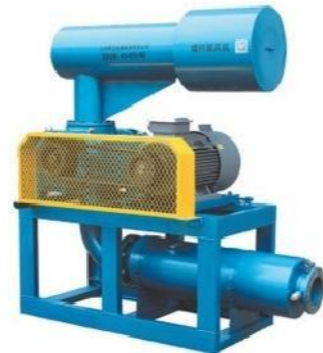
Compacted Roots blower