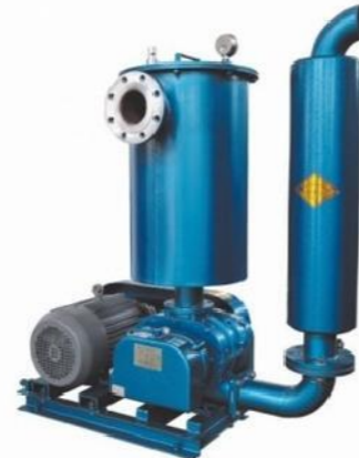
Lithium battery specific negative pressure Roots blower